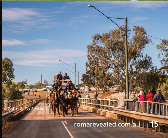
Cobb & Co Festival