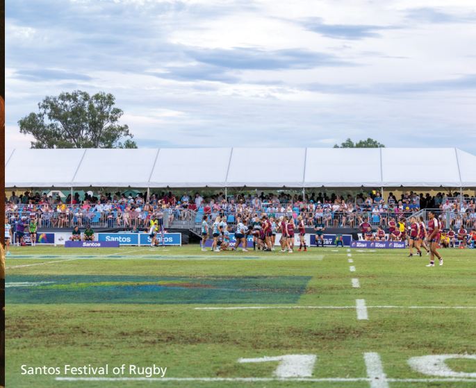
Santos Festival of Rugby