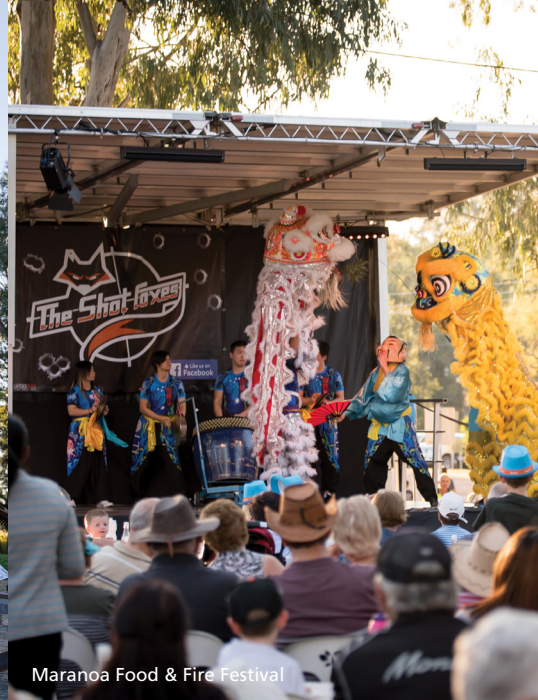
Maranoa Food & Fire Festival