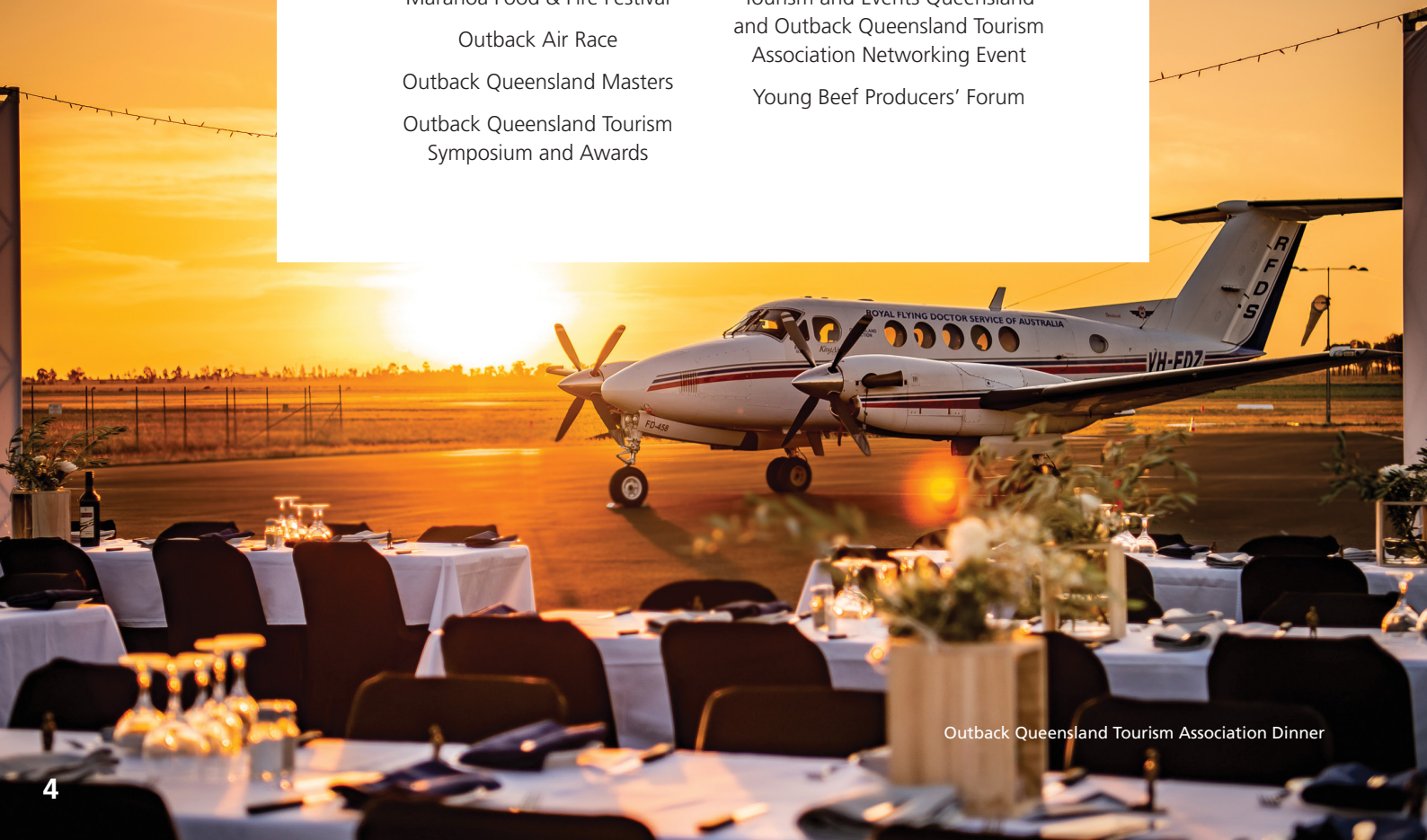
Outback Queensland Tourism Association Dinner