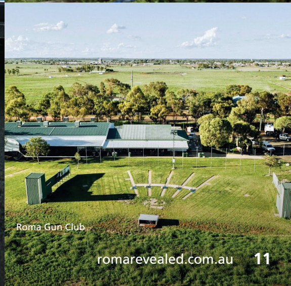
Roma Gun Club