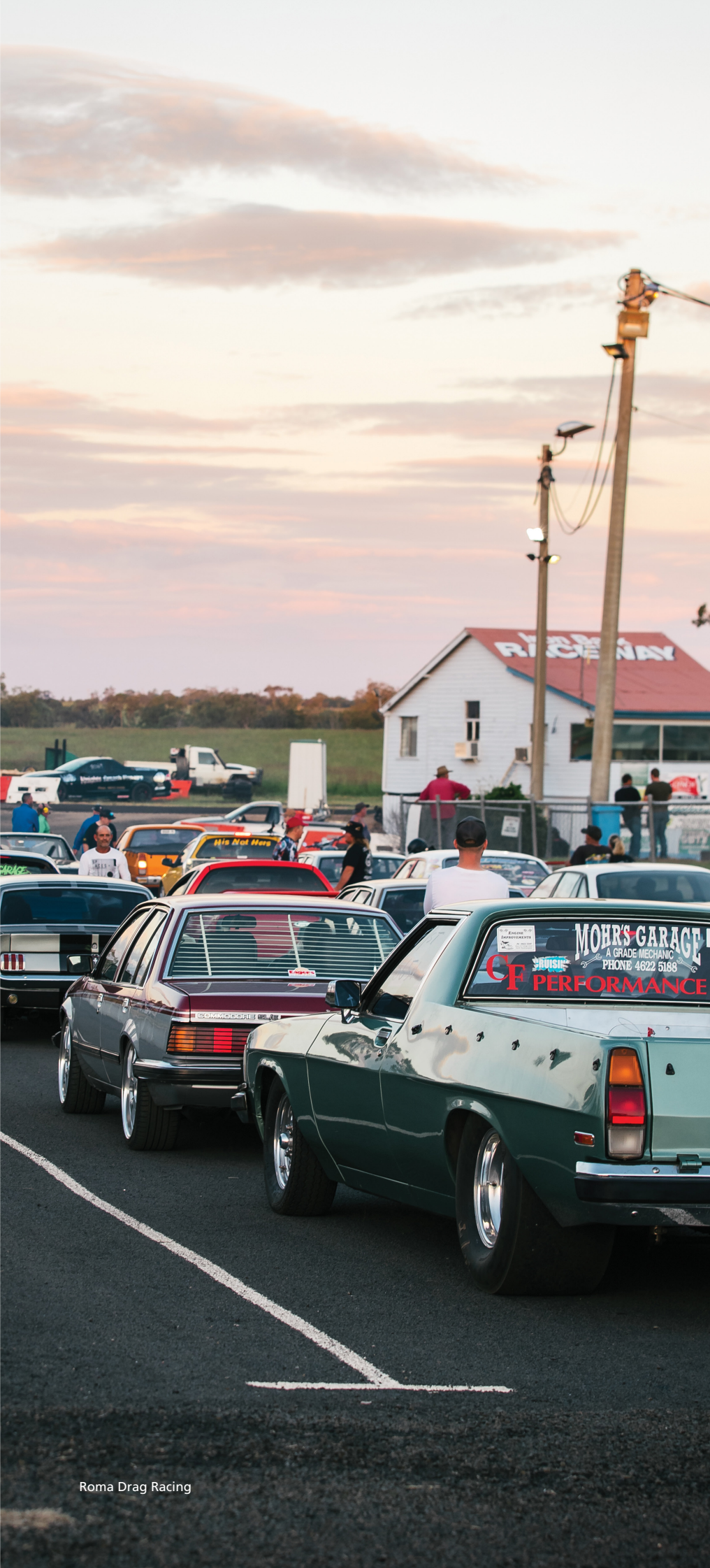
Roma Drag Racing