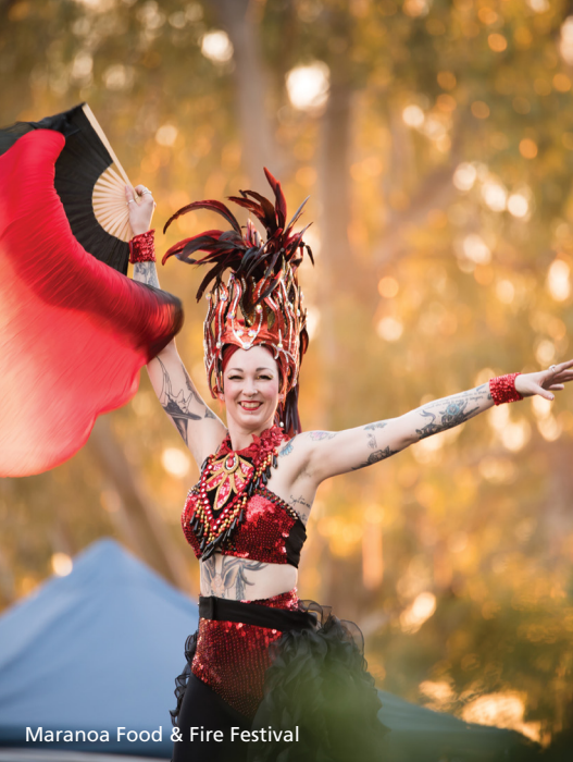
Maranoa Food & Fire Festival