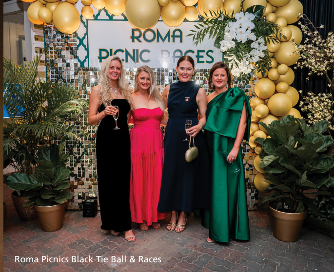
Roma Picnics Black Tie Ball & Races