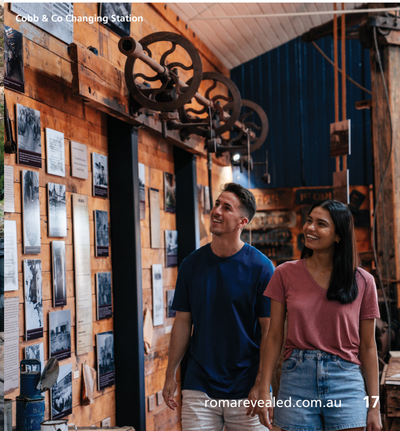
Cobb & Co Changing Station