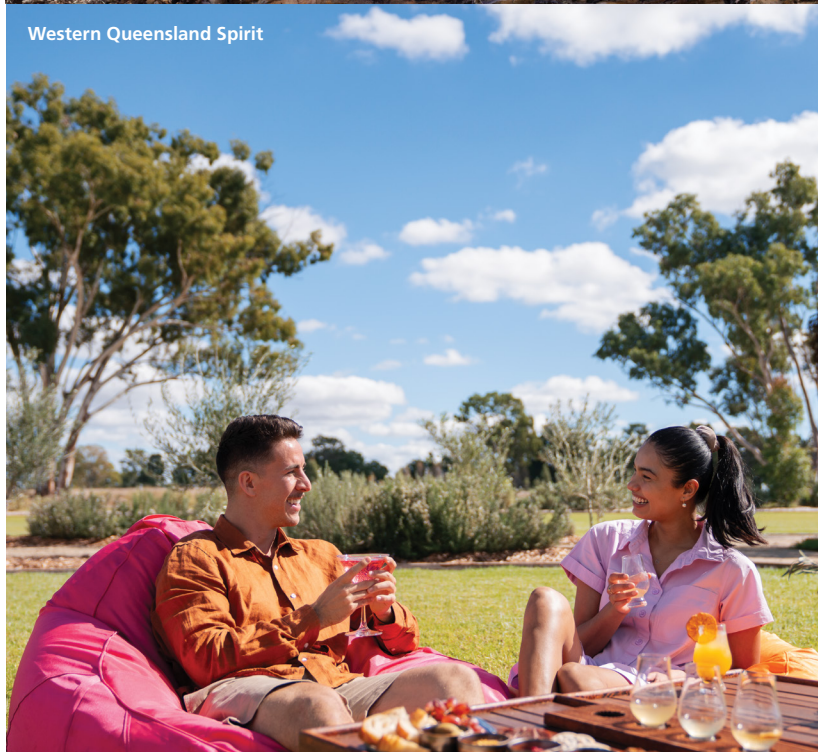
Western Queensland Spirit