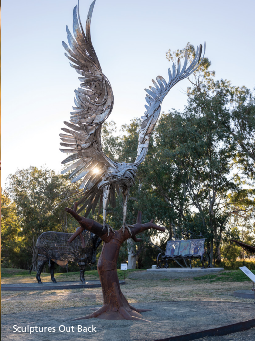
Sculptures Out Back