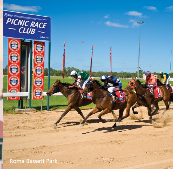
Roma Bassett Park