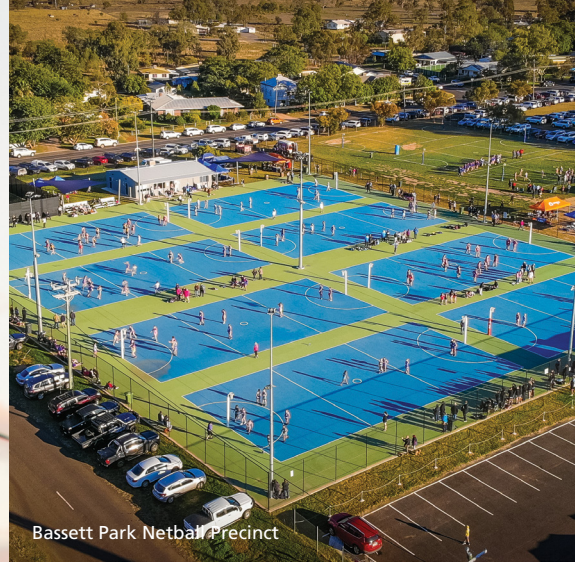
Bassett Park Netball Precinct