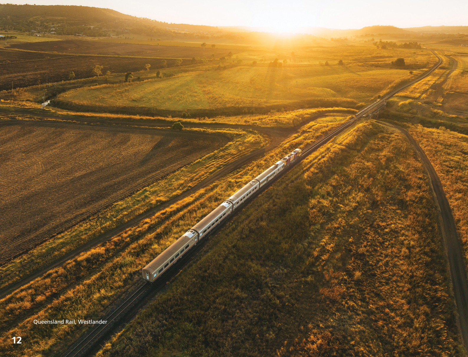
Queensland Rail, Westlander