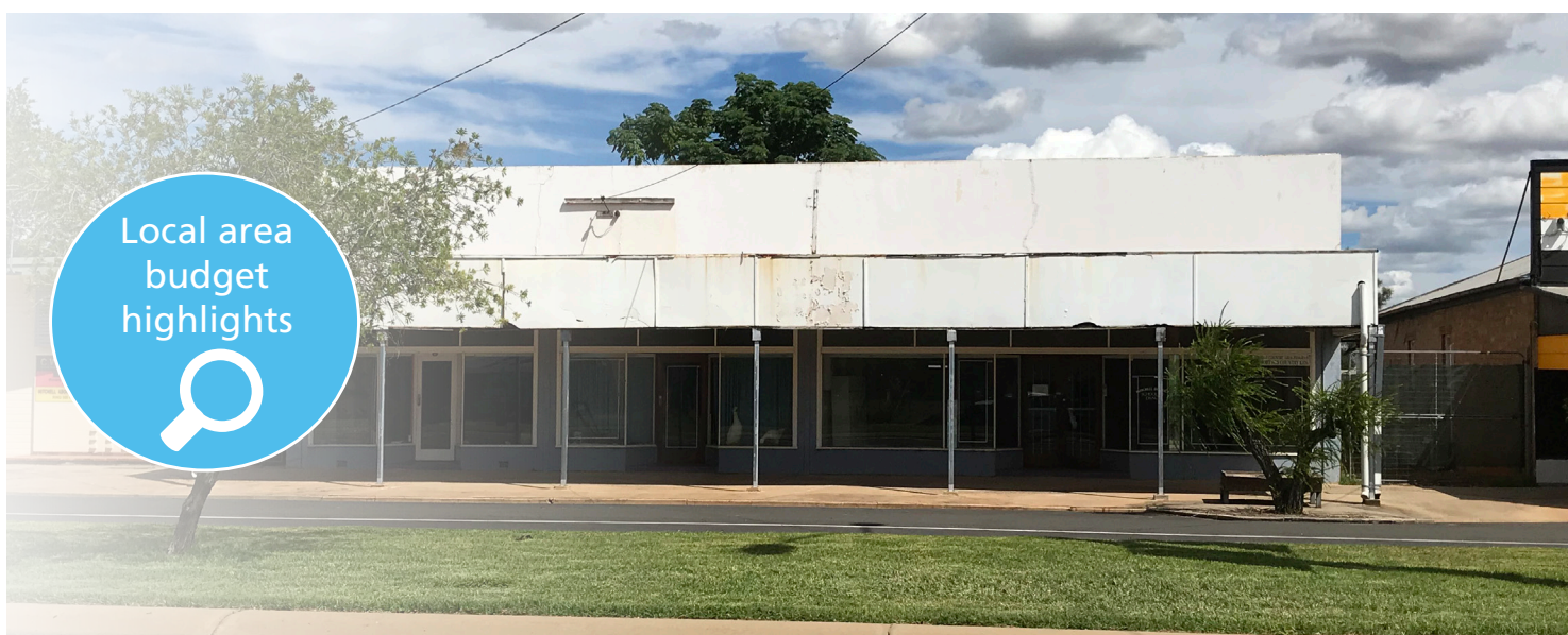
Mitchell Dance Studio

* funded through the Australian Government Local Roads and Community Infrastructure funding program