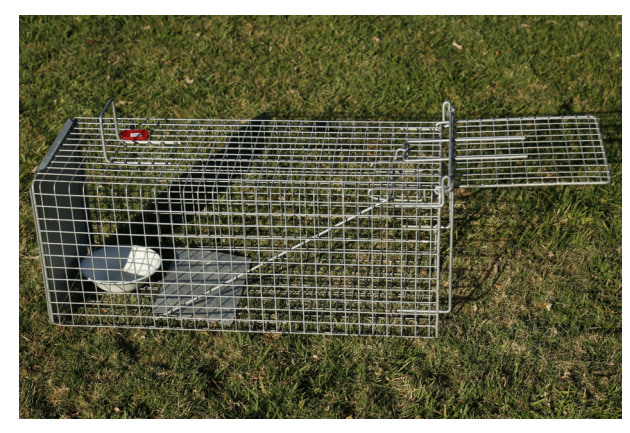
Please be aware the animal may be distressed and aggressive.

6. The trap should look like this once set.