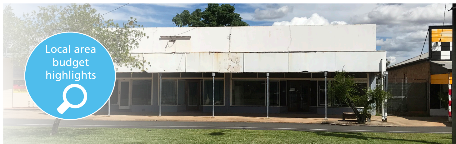
Mitchell Dance Studio