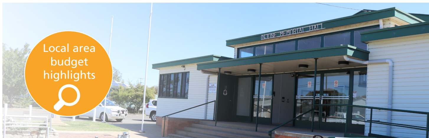
Injune Memorial Hall