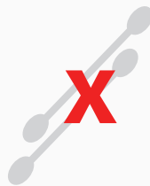
Cotton buds and cotton wool balls