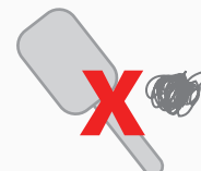
Hair balls from hairbrushes

For more information, please contact Council's Sewerage Team on 1300 007 662.