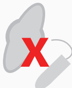
Feminine Hygiene products