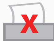
Wet wipes (including baby wipes, facial wipes and cleaning wipes)