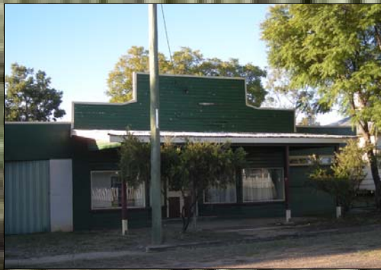
The old hardware store should be one of many buildings included on the trail