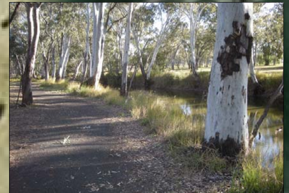
The Lagoon Walk is popular with people camped overnight at the caravan park