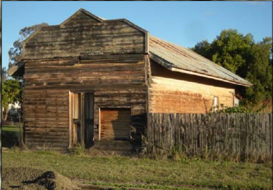
Injune has numerous old buildings, each with fascinating histories