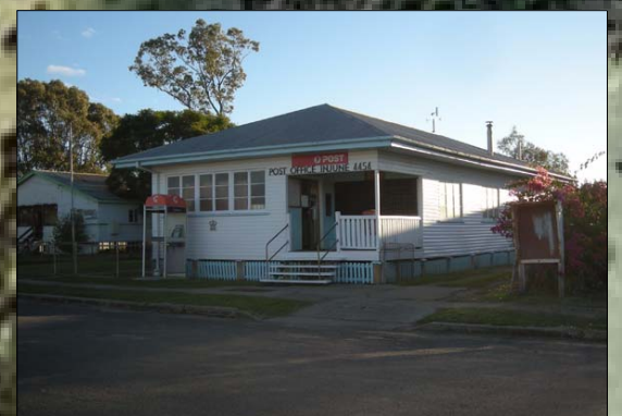
Landmark buildings such as the Post Office (above) and the hotel (below) should be included on the proposed Injune heritage trail